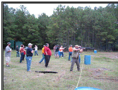
Shooters at the 90-Foot Firing Line