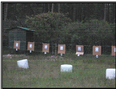
16-Station Turkey Shoot Target Layout